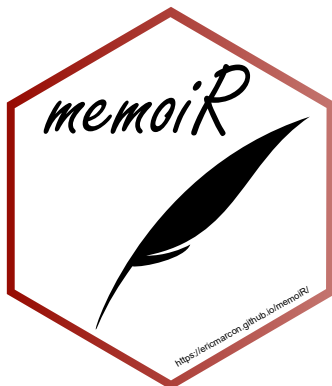
Figure 2: A figure from a file